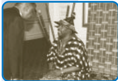
Drums of Africa welcomes guests to the Band Aid Ball.

The drums of Africa greeted guests as they filled the ballroom of the Fairview Park Marriott to celebrate the Band Aid Ball Goes to Africa. Surrounded by beautiful African textiles, carvings and plants, 320 friends bid on an array of silent auction gifts before dinner.