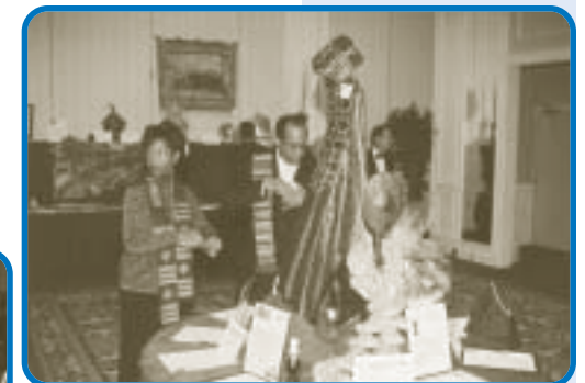
Scenes from the Band Aid Ball Silent Auction