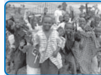
The children of Lare.

Located in the Rift Valley, a natural disaster area due to drought, is the desperately poor village of Lare, Kenya. Lare and the surrounding countryside is home to roughly 28,000 people living in rural cluster communities without clean water or electricity. Approximately 500 families are literally starving to death. Malnutrition and dehydration of young infants, toddlers and the elderly have become commonplace health problems.