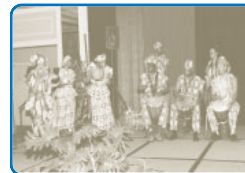
Soul in Motion Players