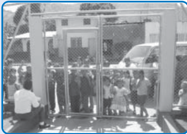
Waiting to see the dentist.