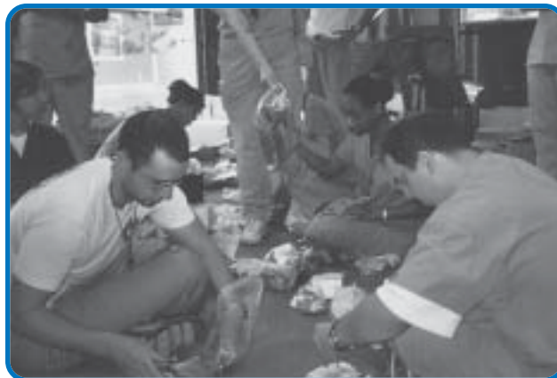
Checking the meds.

"In no small measure the assistance that CrossLink has provided to us is a tremendous help in the accomplishment of our missionary work. The donations and provision of medicine that you offered to our mission this year so far exceeded our expectations that words cannot express my gratitude. I was literally stunned with excitement and humility at the sheer quantity and the quality of the medicines and supplies from CrossLink. After opening the boxes and praising God for these great gifts, I began planning all of the additional assistance we were going to be able to provide with these donations. Our efforts for these people would be significantly different without your generosity and your willingness to partner with us in carrying out the plan that God has for them.