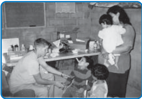
Children visit the Piedras Negras Clinic.

Each year students from the College of Nursing and Allied Health Professions at the University of Louisiana at Lafayette provide health care, health counseling and health education to the needy of the Piedras Negras area of Mexico. The number of students attending each year increases, with more than 60 people serving on this year's team.