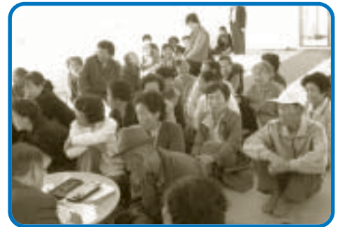
Waiting to be seen.

Many of them wanted to know why we do this for free and asked why we are working so hard in such a poor environment, yet seem so happy. We were so glad to tell them that God loves them so much. Thank you, CrossLink, for helping us to share His love.