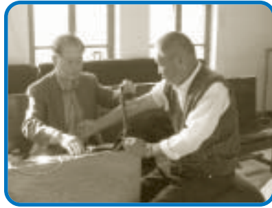
Providing medical care in a church clinic in China.

(excerpted from a team report – no names are used because of political situations)