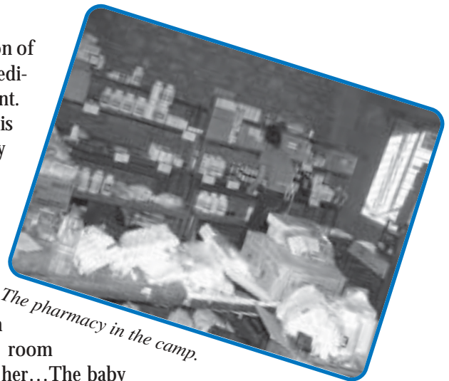
The pharmacy in the camp.