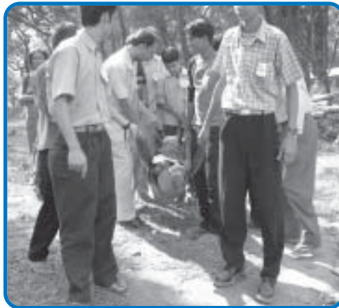
Bringing the sick to the medical camp.

"The close of this day came quickly. The camp was closed and everything was packed away and prepared for the next day. We had to be out of the area soon and through the last army checkpoint before the road closed for the night. The team made its way down the hill from the medical campsite to the village below. Our medical director had gone down the hill in a group ahead of me. As I ap-