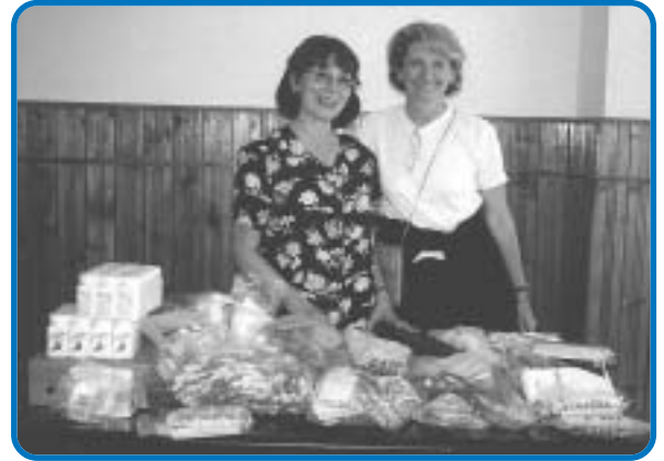
Looking over the medicines at the hospital.

“Two years ago, while on a Habitat for Humanity trip to Romania, I took a group of American volunteers to a mountain village to deliver much needed medical supplies that one of the volunteers brought with her. We were all shocked by the conditions of the clinic and the lack of basic medical supplies and equipment. Two years later, after taking several trips to Romania to talk to local officials, politicians and builders, I embarked on the trip of my life. With no experience, no expertise, and no knowledge, I left my family and my country for 3 months to do what I believed needed to be done: rebuild the clinic. I had only one request; that of a written guarantee assuring me that the clinic would not be sold. Imagine my shock when I arrived and was told that the government was in the process of privatizing all clinics. I knew I did not want do a project that would be sold for profit and I started thinking fast about what else I could do with my time and the donated funds and materials. “