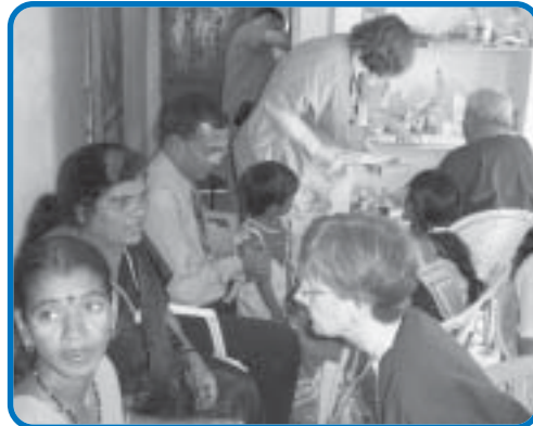
Waiting to be treated by the doctor.

“There was a quote in our devotion book that said, ‘I will never be the same for having seen the other side of the moon.’ We have traveled and seen the other side of the moon, and none of us will ever be the same again. God has used us and blessed us.”