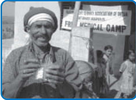
A villager with his free medicines.

The medical mission team from Bartlett United Methodist Church of Bartlett, TN worked for 6 days in Nagpur, – the exact geographical center of India. Four medical clinics were held and approximately 1200 lives were touched by these compassionate medical professionals.