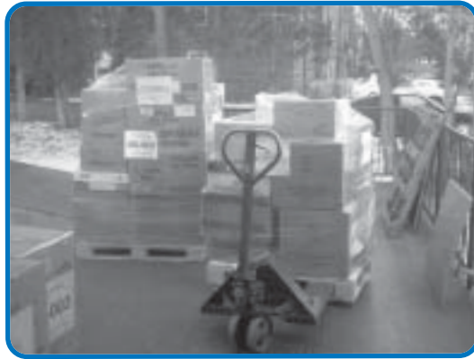
Meds and supplies for Indonesia waiting to be loaded.

“A wall of water just came racing over us ....” Every time we’ve heard statements like that or watched those horrific pictures from South Asia, we’ve all asked ourselves, “How can we help?”