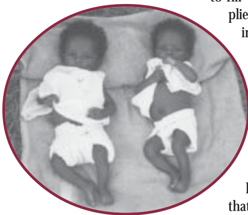
Twins at the clinic.