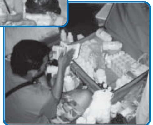
Opening precious medicines in Sri Lanka.