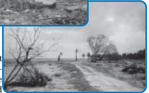
Devastation after the tsunami.